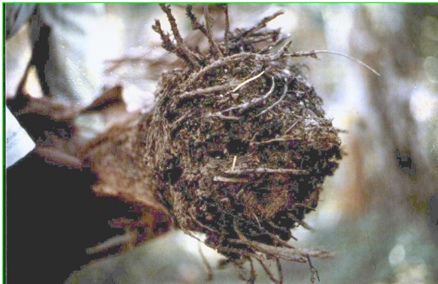
Fig. 6: “Blackhead” of plantain corm and severe root damage caused by Radopholus similis