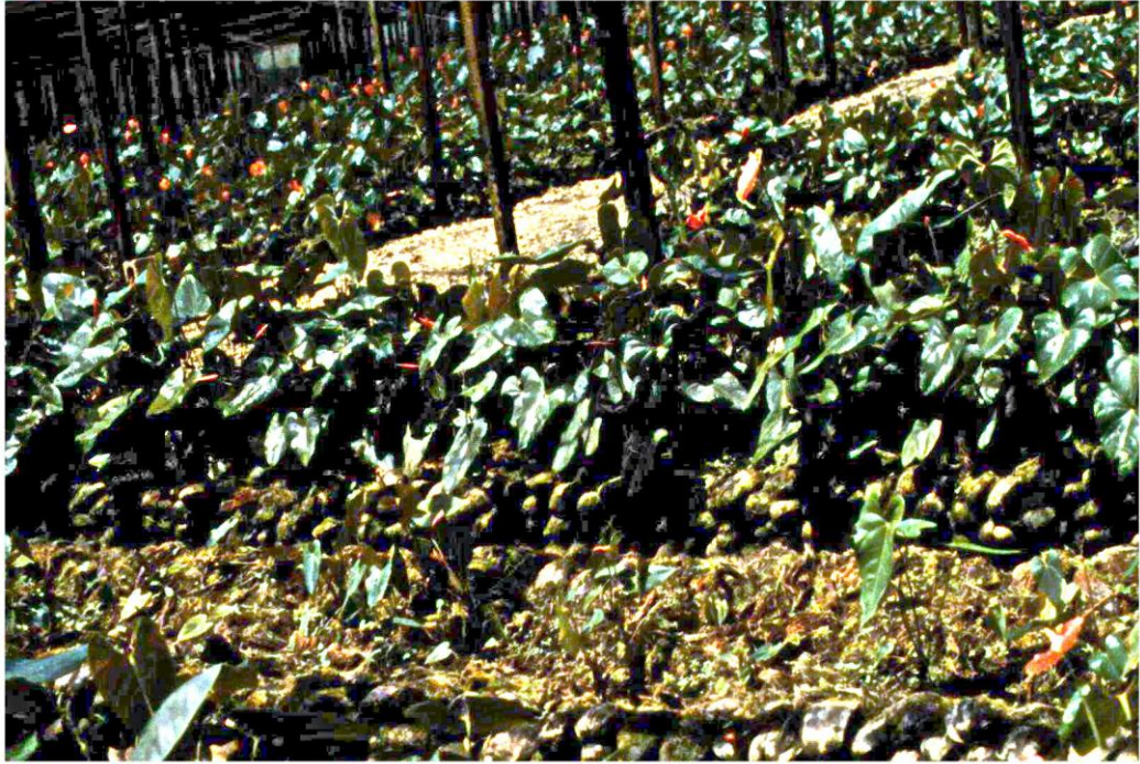
Fig. 2: Thirty-month old anthurium plants in bed in foreground have declined and many have died; bed is weedy, dilapidated, unproductive and in need of replanting due to uncontrolled Radopholus similis infestation. Plants in adjacent bed still vigorous and highly productive, a result of effective nematode control