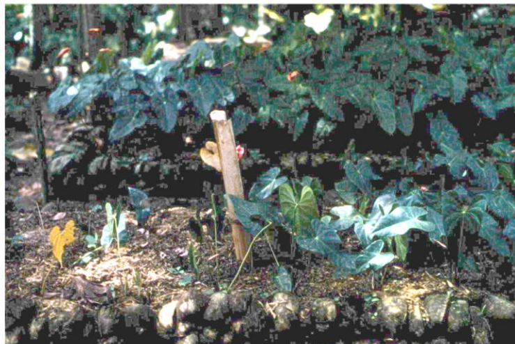
Fig. 3: Four month old anthurium; plot to right of stake treated with an effective nematicide at planting. Plot to the left untreated and plants already showing symptoms of “decline” caused by Radopholus similis