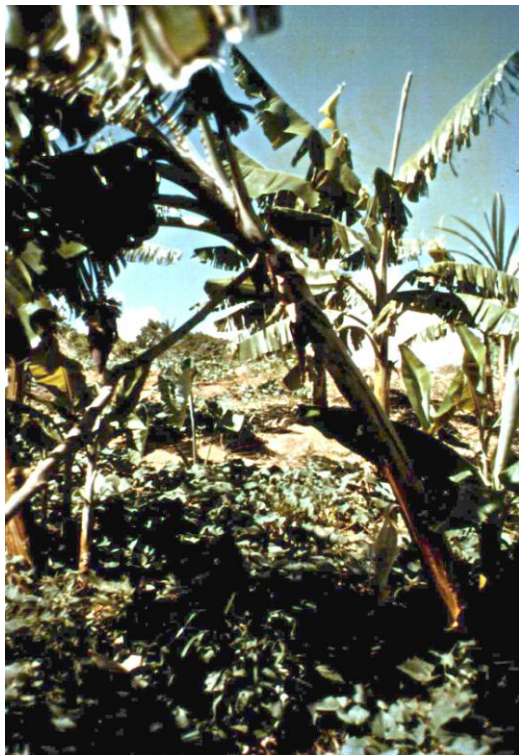
Fig. 1: Puny, unthrifty plantain toppling under weight of undersized bunch due to severe root damage and loss caused by Radopholus similis

http://ucdema.ucdavis.edu/imagemap/nemmap/ENT156HTML/nemas/radopholussimilis