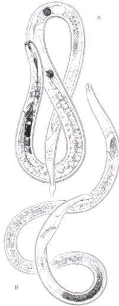
Fig. 4: Radopholus similis (A.) Female (B.) Male (After Cobb, 1915)