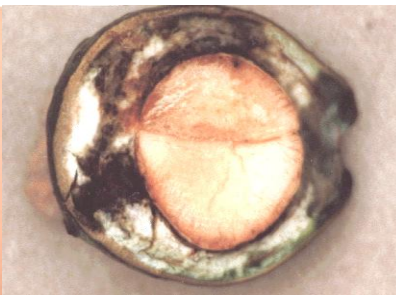
Fig. 2: Tunnels of Stenoma catenifer larva into the flesh of avocado fruit

Stems, growing points, fruits/pods and seeds may be damaged by S. catenifer . Infested fruit