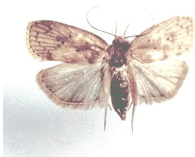
Fig. 3 : Adult of Stenoma catenifer

The adult moth (Fig. 3) is grayish brown, with a wing span about 25 mm; fore-wing with about 25 small dots described as forming an 'S' pattern (Ebeling, 1959; Anonymous, 1980; FAO, 1989; FAO, 1990) towards the outer margin. However, these dots can be more accurately described as forming a 'boomerang-shaped' pattern. There is also a black dot located medially on the forewing (Fig. 4). The frenulum on hind wing of females consists of three long sclerotised bristles, whereas the male frenulum has only one bristle. In addition, there is a large tuft of hair-like scales emanating from between the base of the costa and the subcosta (Anonymous, 1980; FAO, 1989; FAO, 1990).