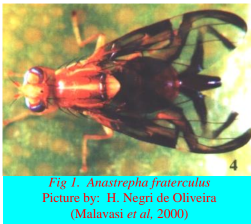
Fig 1. Anastrepha fraterculus (Malavasi et al , 2000)

Adults: About 12 mm long (not including ovipositor of female). Wing expansion about 25 mm. Body rust-yellow or brownish-yellow, with three sulfur-yellow longitudinal stripes on thorax. Wings clear except for characteristic but variable yellow-brown pattern. Inverted V of wing separated from main pattern (Fig 2).