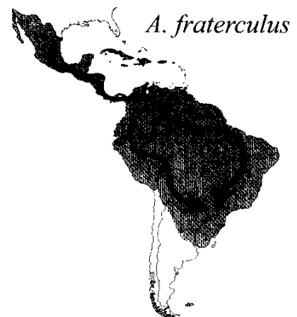
Fig 4. Distribution Anastrepha fraterculus (Malavasi and Zucchi, 2000)

The occurrence of A. fraterculus has been mentioned for the following countries/islands: Argentina to the 37-38°S in the west (Buenos Aires province), Belize, Bolivia, Brazil, Colombia, Costa Rica, Ecuador (including Galapagos islands), El Salvador, Guatemala, Guyana, Honduras, Mexico (from Rio Grande Valley, eastern Mexico, Yucatan), Nicaragua, Panama, Peru, Trinidad & Tobago, Uruguay, Venezuela.